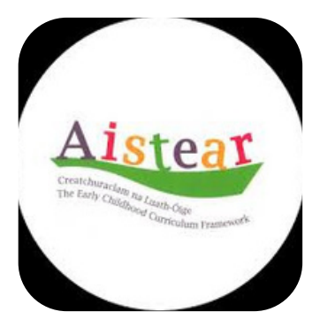
Aistear and <u>Síolta</u>