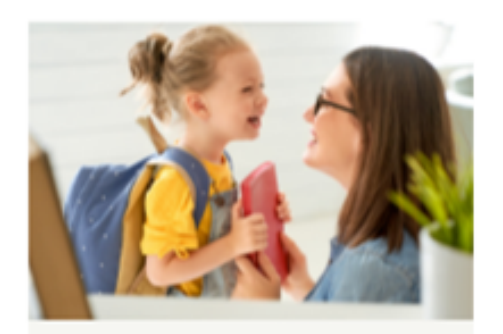
Keeping You and Your Child safe + Mental Health and Wellbeing

Parenting is rewarding and challenging. But, whatever age your child is and no matter how experienced you are, all parents will benefit from a little support and advice. There's lots of information out there. The Supporting Parents initiative is bringing together trusted, high quality resources in one place, to help you navigate your parenting journey. We will continuously update this page as new resources become available locally and nationally.