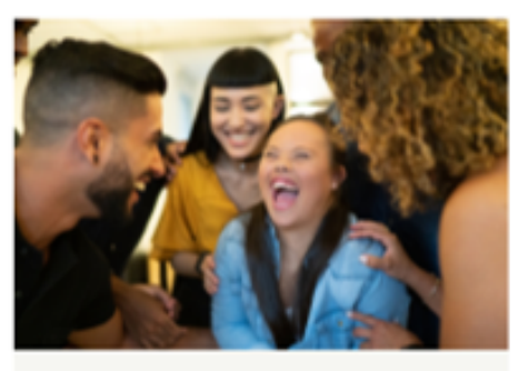
Children with Additional Needs