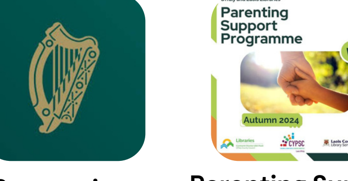
Parenting Support Programme